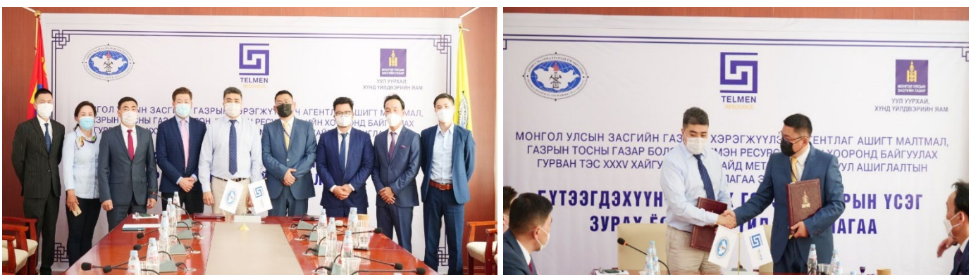
PSA Signing Ceremony – Ulaanbaatar, Mongolia