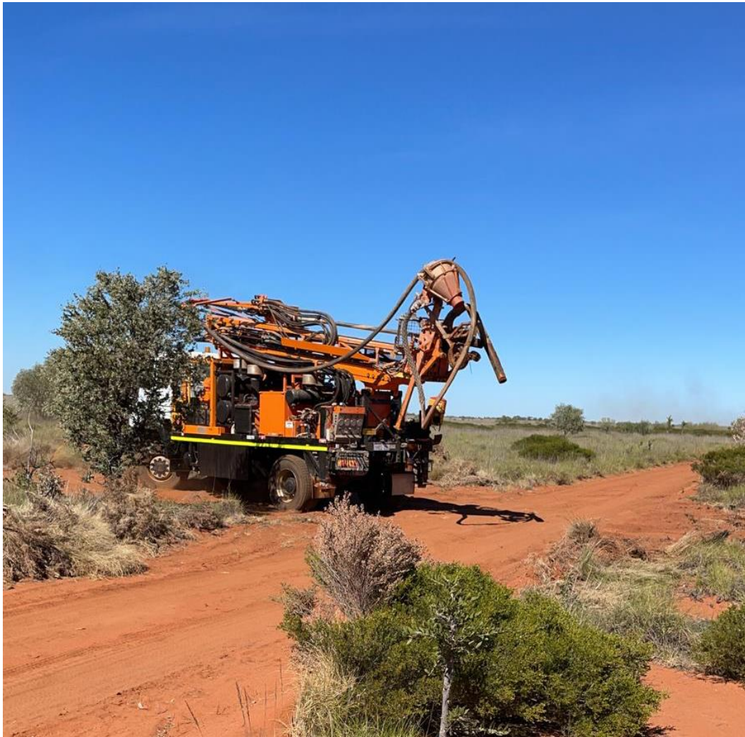
Figure 3: Drill rig mobilising