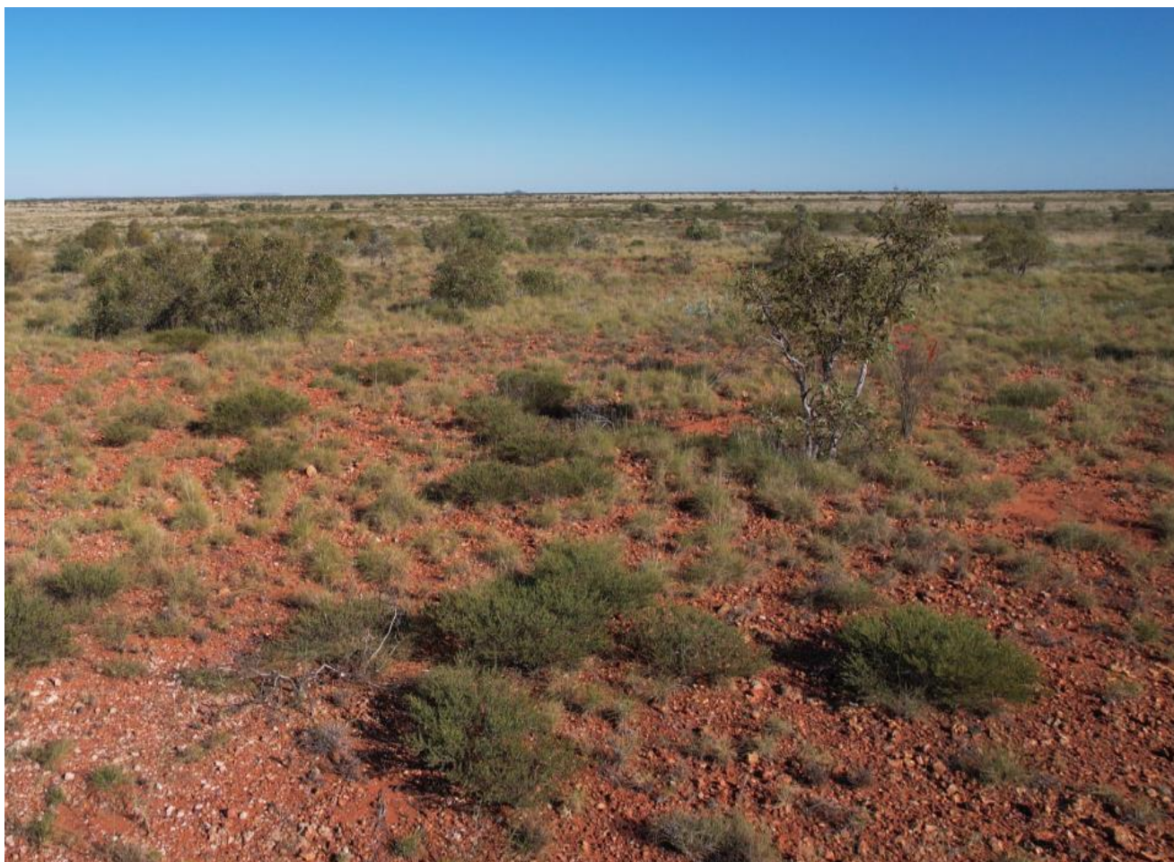
Figure 2: Diorite outcropping discovered on Roberts Hill drill line

The Company's flagship Roberts Hill and Mount Berghaus projects are located in the Mallina Basin which also hosts De Grey Mining Limited's (ASX: DEG) Hemi discovery of over 6.8m oz Au (refer to DEG announcement dated 23 June 2021 for further details). Neither of the Company's projects have been previously drill tested and whilst transported soil cover is present throughout the Roberts Hill tenement, it is anticipated that overburden thicknesses will vary from zero (where outcrop has recently been discovered) to 40 metres.