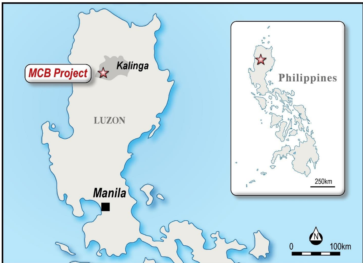
Figure 1: Location of the MCB Project in the province of Kalinga, Northern Luzon, Philippines.

A maiden JORC compliant Mineral Resource was declared for the MCB Project in January 2021, comprising 313.8 million tonnes @ 0.48% copper and 0.15 g/t gold, for 1.5 million tonnes of contained copper and 1.47 million ounces of gold.