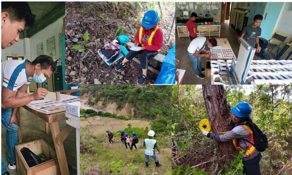
Images 3-7. Social and Environmental study teams during their field data gathering at MCB and laboratory analysis at KSU.

In compliance with the MCB exploration permit conditions, field data gathering and laboratory analysis for the Social and Environmental Baseline Studies commenced this month in partnership with the Kalinga State University. The results of these studies will feed into the development of the project's future environmental and social impact management plans along with other further studies which are essential to the project design and approvals. The studies cover socio-economic, pedology, terrestrial and aquatic resources, as well as climatology with various University research teams involved and will be progressively completed by November 2021. Water monitoring studies have already been conducted during the past exploration activities and will supplement the overall environmental study program for MCB.