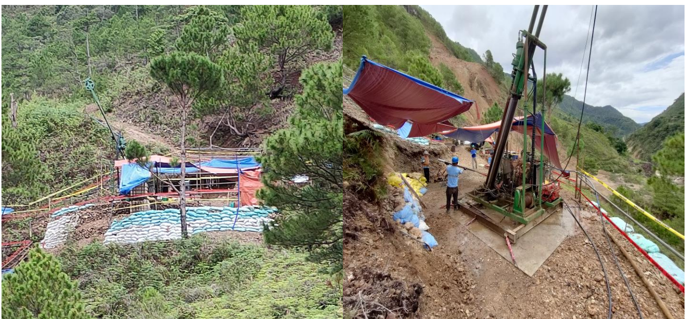
Images 1 & 2 - Drill Rig operating at MCB-036

The third drill hole of the current program at MCB (MCB-036) is underway and was at a depth of 60.0m as of the date of this release. Drill hole MCB-036 is one of two drill holes (including planned hole MCB-035) planned to test for deeper extensions to the high-grade copper-gold mineralisation at MCB.