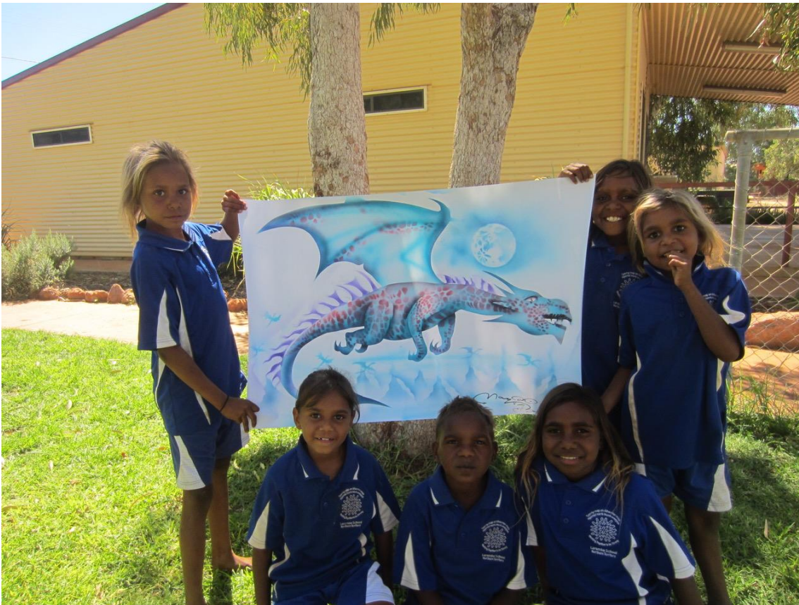
Figure 1 - Enthusiastic Laramba school students proudly showing off their most recent artwork

Arafura’s sponsorship goes directly to the schools who use it to purchase art materials and books for these workshops. Providing the students with the required resources has enabled them to develop their skills, confidence and improve their ability to express themselves through creative processes. These learnings are a steppingstone which will allow the students to become valuable members of their communities now and in the future.