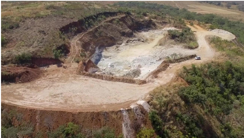
Figure 2 – Arcadia open pit being utilised for the pilot plant

Operating the pilot plant has allowed for substantial operational learnings from blast and haul techniques (Figure 2) through to material handling to minimise contamination and increase productivity. Technical learnings have been derived from a broad adaptation of the operating conditions, allowing the team to characterise metallurgical behaviour across permutations of plant operating conditions.