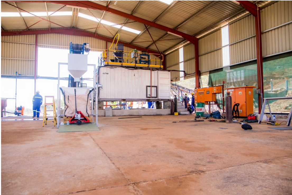
Figure 1 – Dense Media Separation (DMS) unit

On 25 June 2021, Prospect announced the completion of construction and commissioning, and the commencement of production, at the Arcadia Pilot Plant. The construction and operation of the Pilot Plant is purposed to the production of high purity petalite concentrate samples for Prospect's long-term technical petalite customer base.