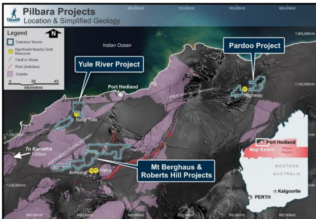
Figure 2: Pilbara Projects Map

The Company also continued its exploration efforts across its entire portfolio of projects including the commencement of a calcrete/laterite/soil sampling program at its Pardoo project. The Pardoo project is located within the boundaries of the Great Sandy Desert and offers an excellent opportunity to examine potential gold/base metal geochemistry of calcrete located in more northerly regions of Australia.