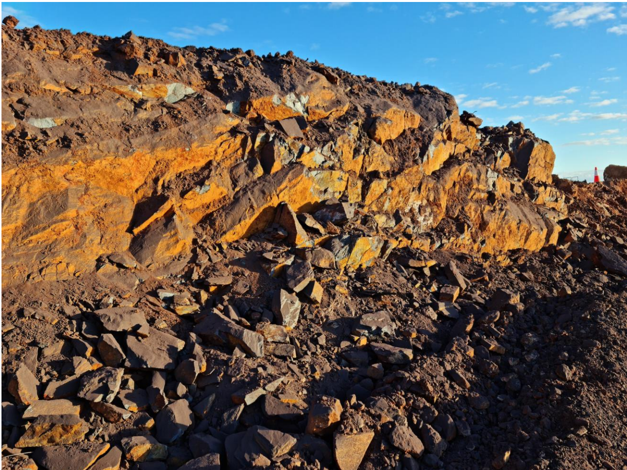
Figure 1: High grade ore exposed in JWD Pit