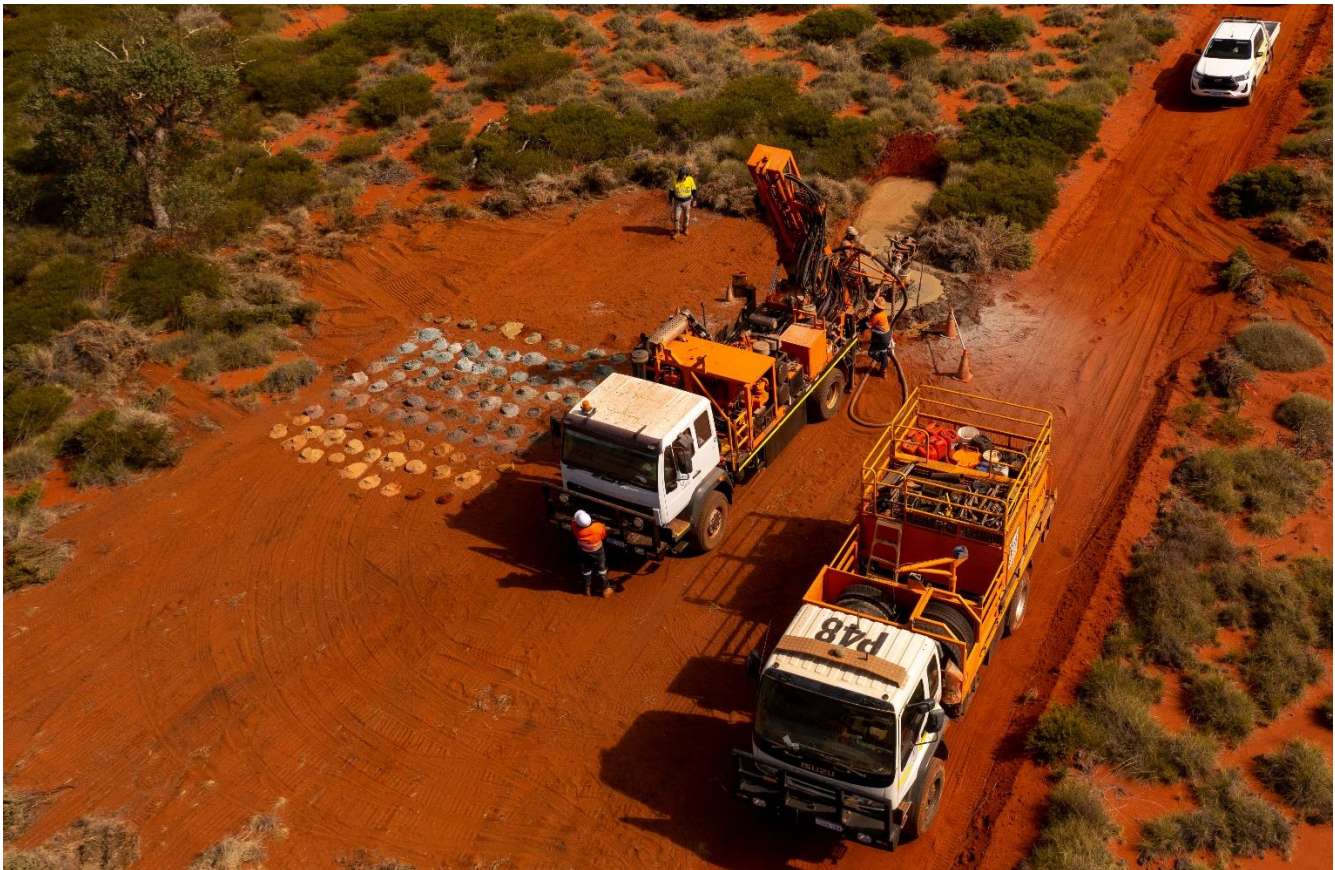
Figure 1: Air-core drilling at Roberts Hill

Caeneus Minerals Limited (the Company) (ASX: CAD) is pleased to advise that its maiden drilling campaign at Roberts Hill is underway. Apart from one historical water bore, no drilling has been carried out on the Roberts Hill tenement. For this first drilling program, the Company has elected to conduct a 20,000m air-core exploratory drilling campaign.