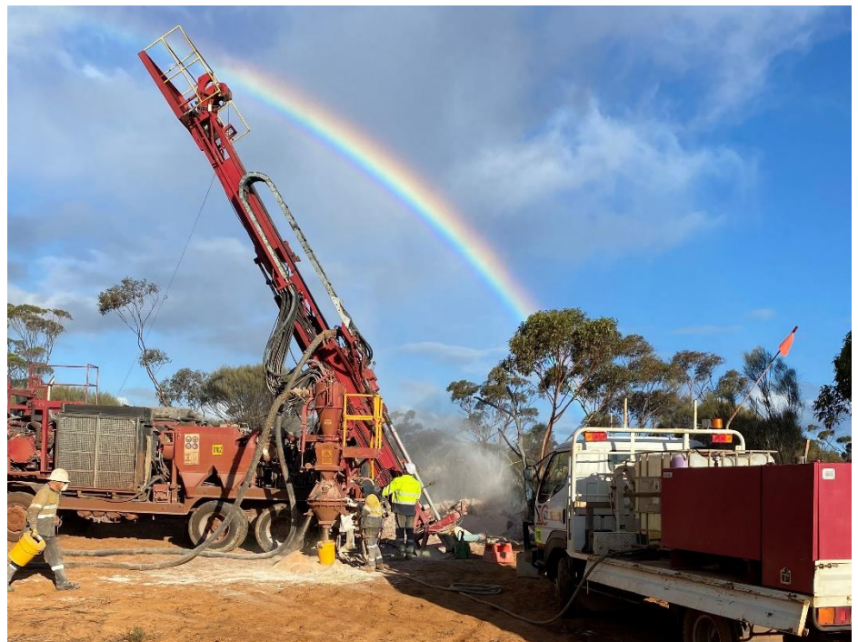
Figure 1 – RC drill rig at Mt Dimer during the July 2021 Drill Programme

All initial samples have been dispatched to the assay laboratory and the Company expects assays to be returned in approximately five weeks.