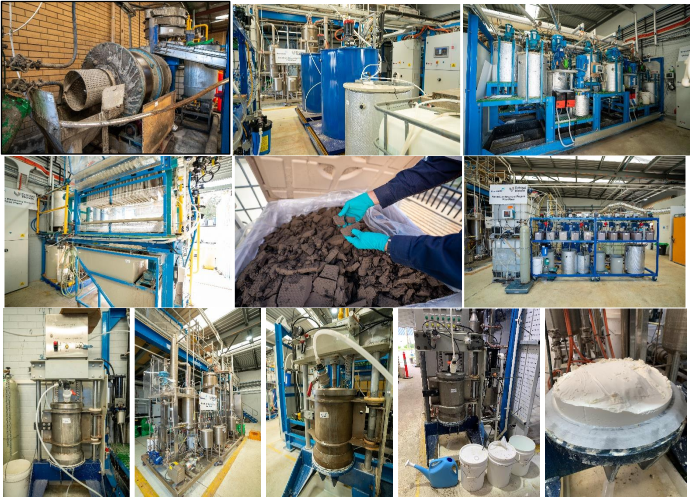
Figures 1 - 11 - Selected images of the Pilot;

Row 1 (Figures 1 – 3, left-right): the ball mill, the leach feed tanks, the integrated leach and regrind circuit