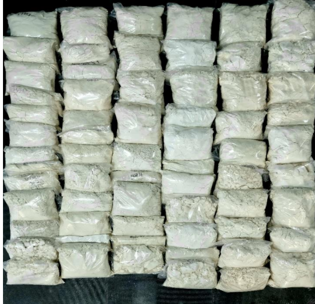
Figure 13 – Selected Bags of AMV product (weighing 3-5kg each) produced during the pilot plant operation

The product samples (AMV, V 2 O 5 and SSM) will continue to be progressively delivered to potential offtake parties to advance commercial discussions.