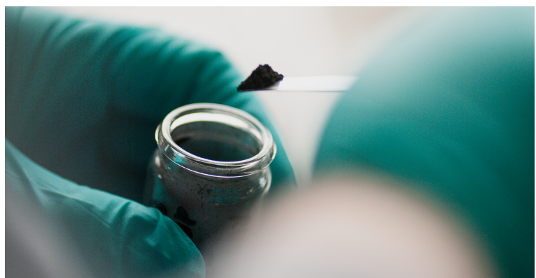
Figure 1 Talnode®-C, the world's greenest graphite anode

Talga's northern Swedish location has proximity to customers and availability of low-carbon transport options, such as electric trains, providing further mine-to-customer environmental advantages past the factory gate.