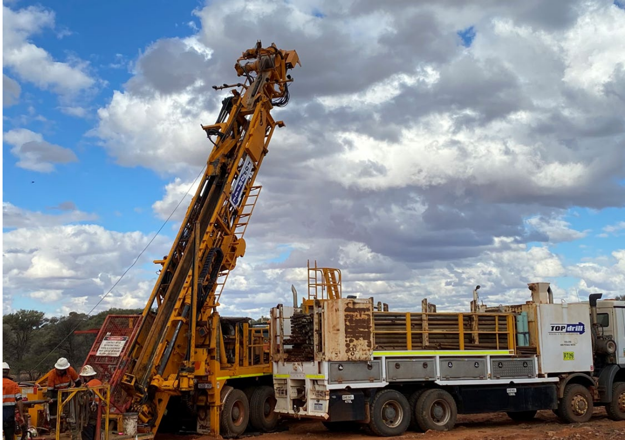
Diamond drilling underway at Coodardy project

Victory's current exploration program includes resource definition drill programs at Coodardy and Eaglehawk combined with testing of mineralisation extensions at Emily Wells. Approximately 6,400 metres of planned diamond drilling and approximately 1,800 metres of planned reverse circulation drilling are to be undertaken in the September and December quarters.