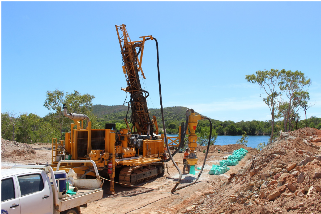
Horn Island, Close Spaced Drilling Program.

Approved by the Board of Alice Queen Limited.