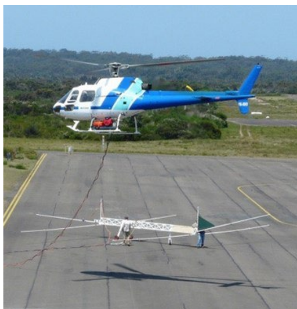
Figure 1: Airborne Geosolutions TDEM REPTM data capture system.

The Company has engaged Planetary Geophysics and Geosolutions to conduct an extensive, 1,092-line kilometre REP-TEM airborne Electro Magnetic (EM) survey over the Mt Chalmers area. The program will extend to the north-west and south-east of the Mt Chalmers mine, covering an extensive area of the Berserker Beds. This survey is scheduled to commence in H2-2021 and will be used in conjunction with all current data sets to define future potential VHMS drill targets.