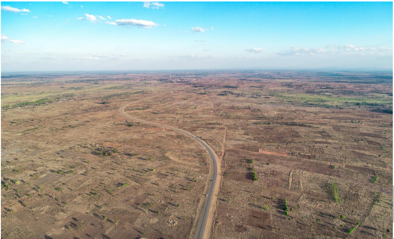
Figure 3. Drone image at the Nsaru area showing typical flat and open landscape of central Malawi.