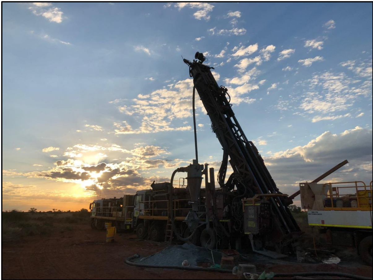
Figure 1: RC drilling of gold targets during August 2021 at Yule South in the Mallina Basin.

Gold and base metals exploration company Golden State Mining Limited (ASX code: "GSM" or the "Company") is pleased to announce the completion of its RC drill program over three gold target areas at the Yule project in the Mallina Basin.