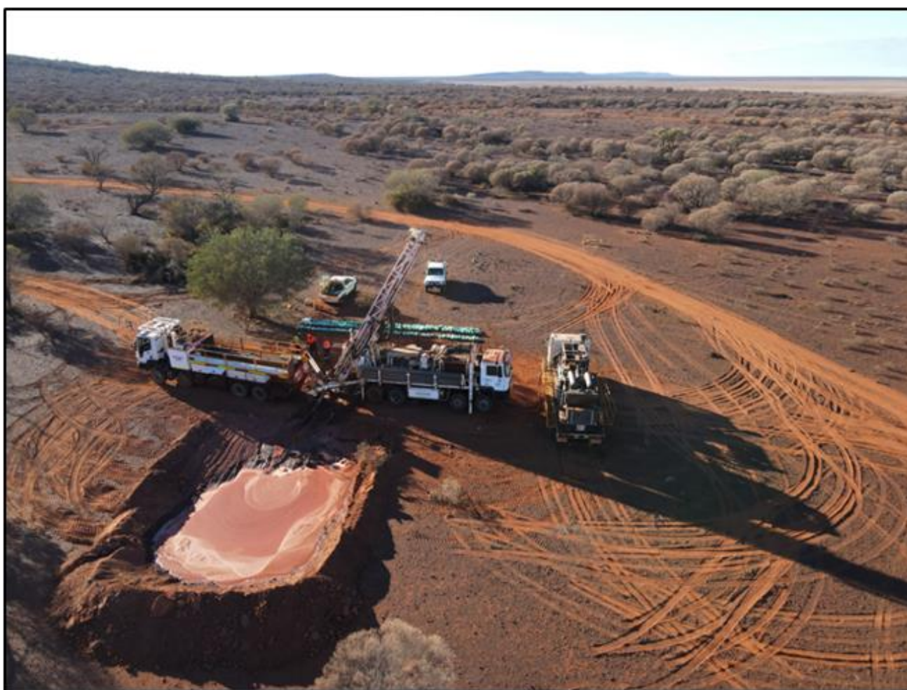
Image 1 – RC Drilling at Chinook – Looking southeast towards Magazine (distant hills)