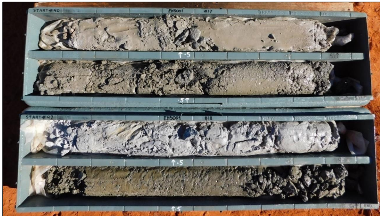
Image 2 – Mineralisation Zone –Sonic Drilling Core – EHS001 (twin of EHRC050). Sphalerite, galena and pyrite mineralisation was logged in this soft primary zone.

Rumble has engaged Sonic drilling specialists (Groundwave Drilling Services) to assist in improving the core recovery within the mineralized zones. The Sonic drilling program will initially twin three (3) drill-holes (EHRC044, EHRC050 and EHRC061). The first drill-hole EHS001 successfully completed a twin hole of EHRC050 (34m @ 4.22% Zn + Pb from 66m – see ASX announcement 19 April 2021), returning very high (95%) core recoveries.