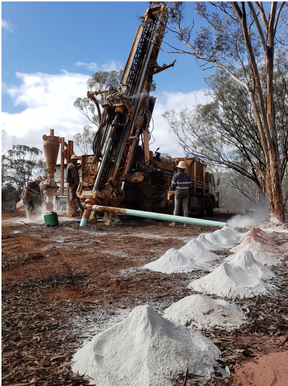
Figure 2 – A photograph of the RC drill rig in action