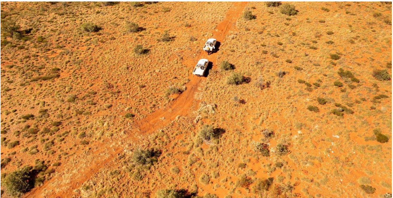
Figure 5: Outcropping at Zone E

The Company has been working closely with Southern Geoscience to further evaluate the airborne geophysical signatures covering a most likely intrusive feature at Zone E. Prospecting, mapping and clearing of new drill tracks has identified highly brecciated, silicified and bleached outcrop. Whilst the occurrence of outcrop in this part of the tenement is unusual, the Company looks forward with interest to the upcoming air-core drilling of this feature during its current Phase 1 activities.