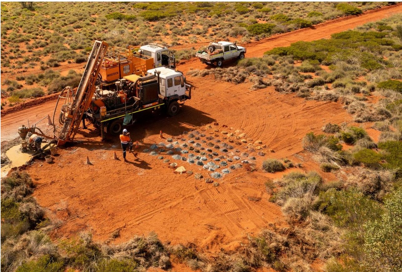
Figure 2: Air-Core Drilling at Roberts Hill

Whilst the occurrence of sulphides in this part of the Mallina Basin is not unexpected, some of the lithologies and quartz veination observed in the drilling has prompted the Company to prepare a new PoW for deeper percussion and/or diamond drilling to further elucidate these observations and assist in the understanding of the geological and geophysical model for Zone A. Additionally, a 4 square kilometre IP survey covering part of Zone A is also planned for immediate commencement should ground teams be available.