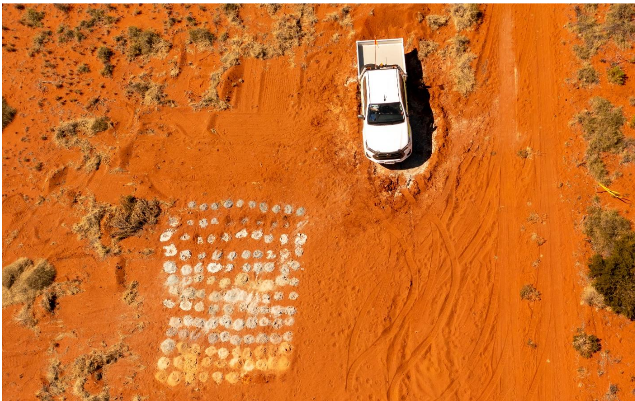
Figure 3: Air-Core samples - Zone A