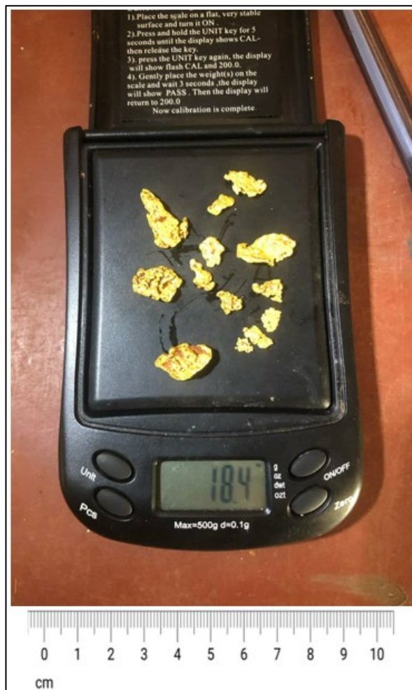
Figure 2. Alluvial gold recovered from the Snake Hill Prospect on P 25/2634. The 13 nuggets weighing 18.4 grams were discovered near surface by prospectors.