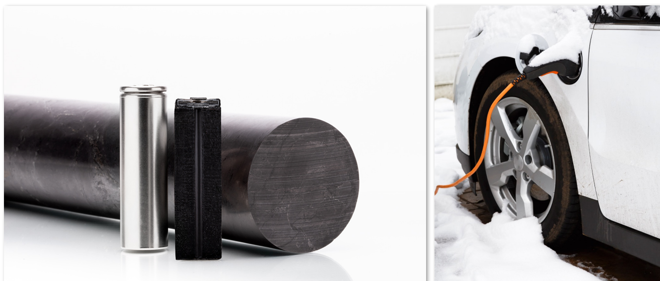
Figure 1 Talga's Vittangi graphite ore is refined into the world's lowest emission lithium-ion battery anodes suitable for electric vehicles and other battery applications to help decarbonise the global economy.

Trial mine operations are scheduled to begin in mid-September and in this first phase of the campaign, approximately 2,500 tonnes of graphite ore is planned to be extracted before the site is rehabilitated for the northern hemisphere winter. Rehabilitation will use the successful measures previously used in the Company's 2015-2016 trial mining campaign at its nearby Nunasvaara South deposit. The balance of the permitted 25,000 tonnes graphite ore is planned to be accessed in 2022.