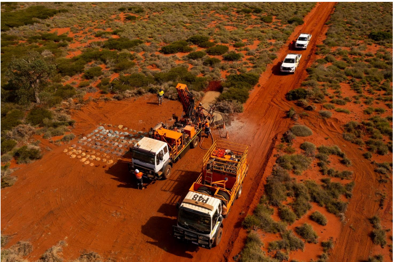
Figure 2: Roberts Hill Air Core Drilling

Whilst the occurrence of traces of sulphides in the Mallina Basin is not an uncommon observation, the Company is pleased to confirm a 28m intersection of abundant coarse sized mixed sulphides from hole RHAC-0104 at Zone C. From 85m to the end of hole (113m) abundant pyrite, pyrrhotite and traces of a silvery sulphide, most likely arsenopyrite were observed initially within pelitic sediments and then terminating in a granitic rock.