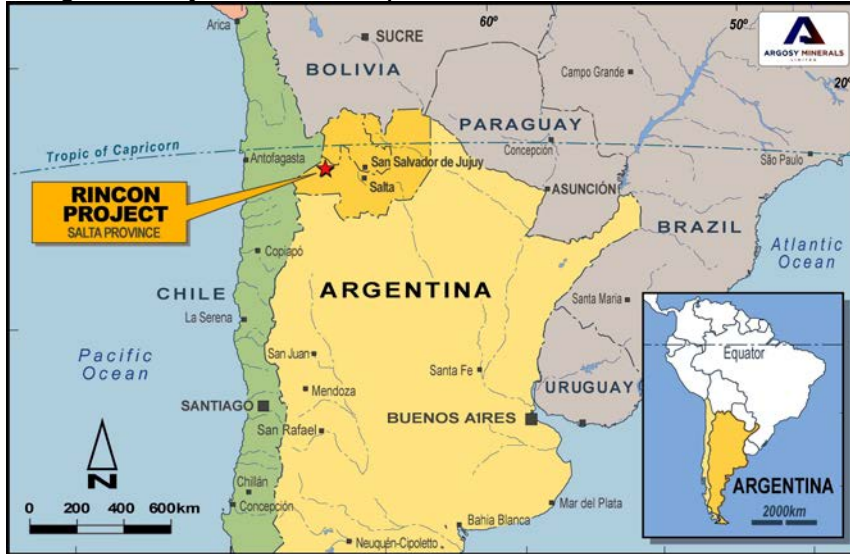
Appendix 1: AGY's Argentina Project Location Map