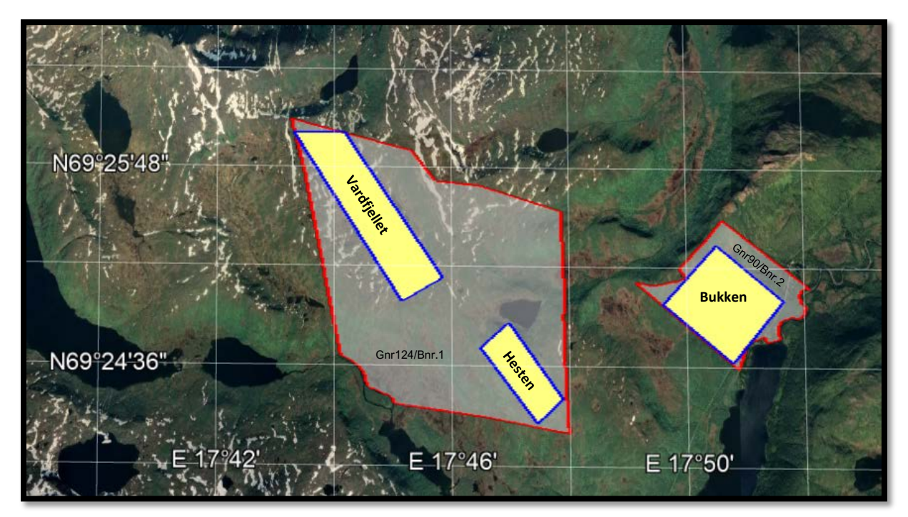
Figure 3- Planned high resolution UAV Electromagnetic and Magnetic Survey (yellow areas) at Bukken in Fjellheim property, Hesten and Vardfjellet in Statskog SF property

The survey will be used to optimise planning for a high-resolution 2D surface seismic (a technology developed by the Smart Exploration Project) to better understand the geological structural framework and drilling target delineation over the Bukken, Hesten and Vardfjellet graphite prospects in 2022.