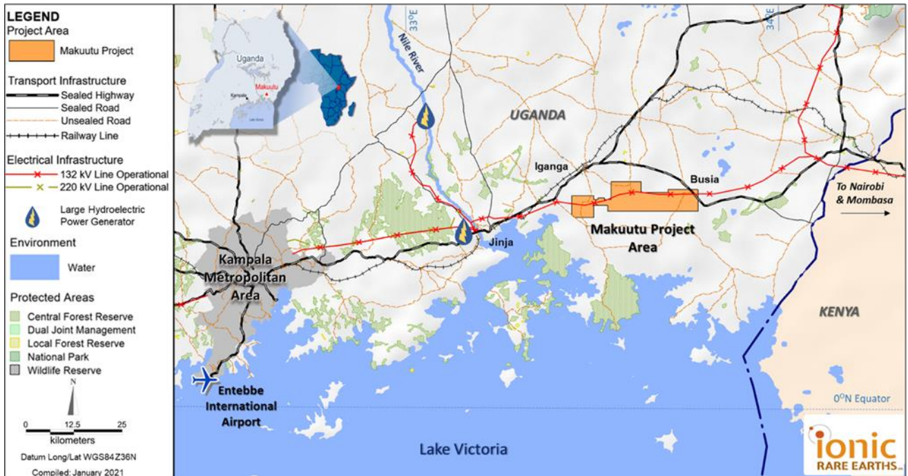
Figure 2: Makuutu Rare Earths Project Location with major existing infrastructure.