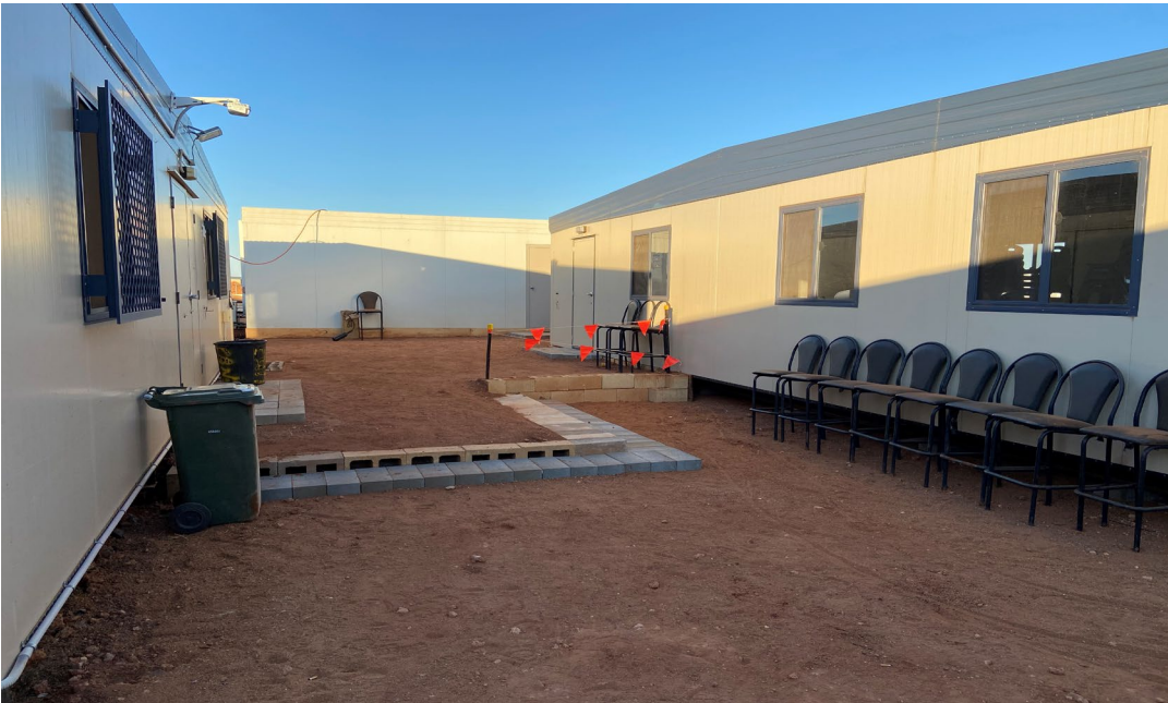
Figure 2: Operational fly camp