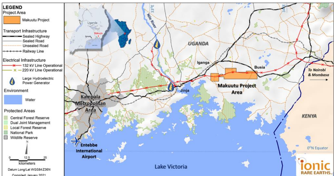
Figure 3: Makuutu Rare Earths Project Location with major existing infrastructure.

The Project has the potential of generating a high margin product with an operation life exceeding 27 years. The Project is also prospective for a low-cost Scandium co-product.