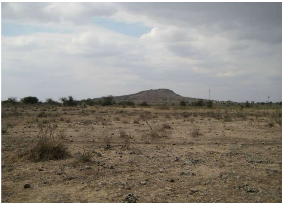
Figure 2: Minjingu Hill looking North looking across the tenement

The Project is part of the East Africa Rift Valley on the eastern margin of the Tanzania craton. The tectonics of the area are dominated by a series of northeast to southwest trending rift related faults and the area is underlain by Neogene volcanics. Geology of the Prospect largely comprises young undifferentiated flat lying Neogene Lake beds which are part of the Lake Manyara Formation.