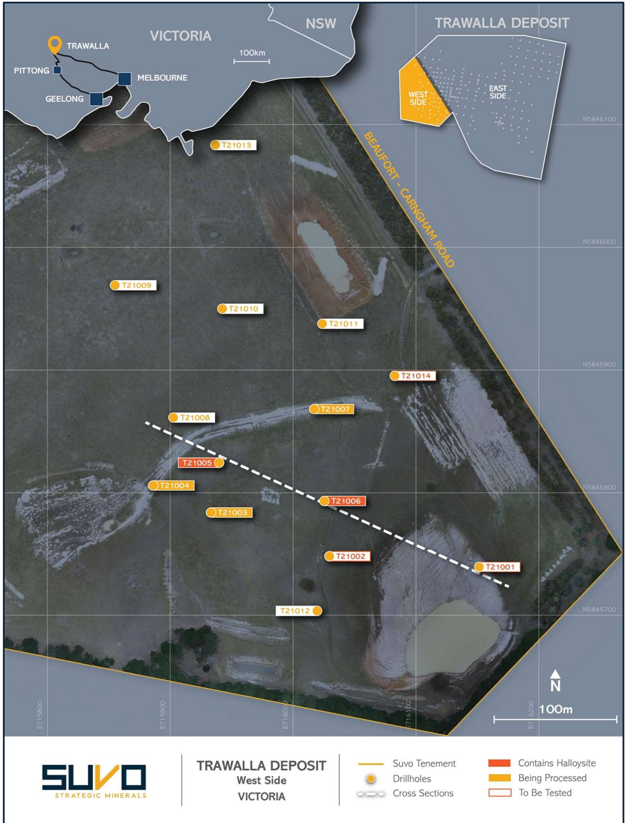
Figure 2: Trawalla drill hole location plan showing samples with halloysite, those being, and to be, tested