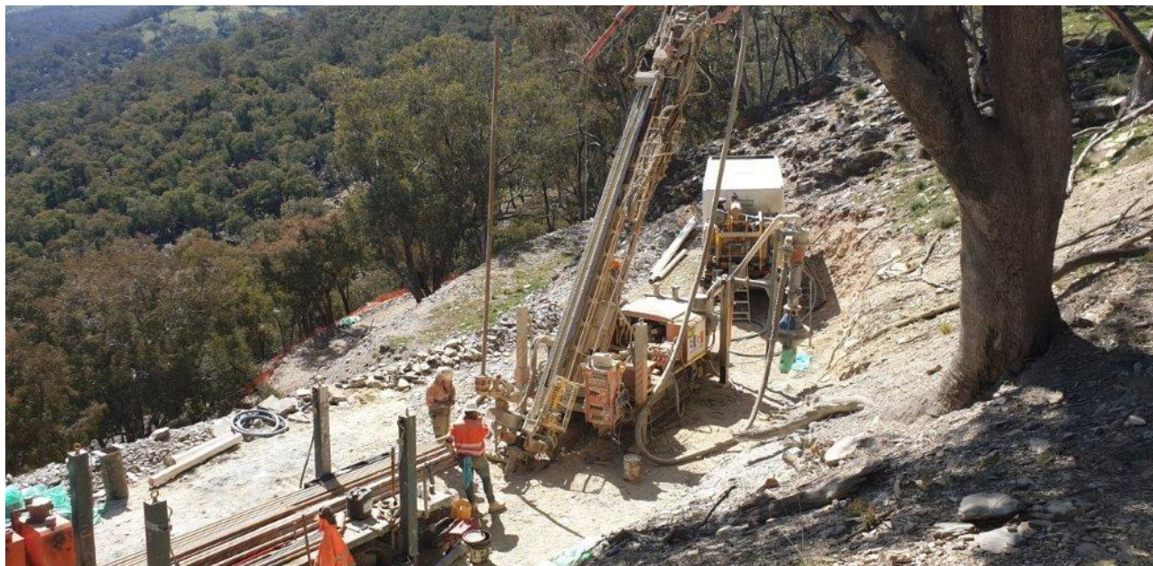
Figure 1 RC Drilling commences on October 5 collaring drill hole APRC049054

Argent Minerals Limited (ASX: ARD) (" Argent " or " the Company ") is pleased to announce the resumption of the RC drilling program over the company's 100% owned historic Pine Ridge Gold Mine Project. Drilling has commenced with a further program of 6 RC drillholes to be completed for a total of approximately 700m.