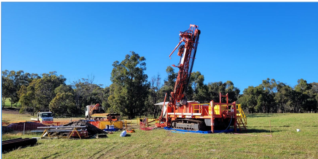
Figure 1. Diamond drill rig in operation at the Sovereign Project, WA. Drilling is designed to understand the geometry and extent of the intrusion at depth including the prospective ultramafic rocks (serpentinite).

The Sovereign Project lies within the highly prospective Julimar Complex (Figure 2) and is located to the north of Chalice Mining Limited’s (ASX: CHN) Julimar Project and south of Caspin Resources Limited’s (ASX: CPN) Yarawindah Brook Project.