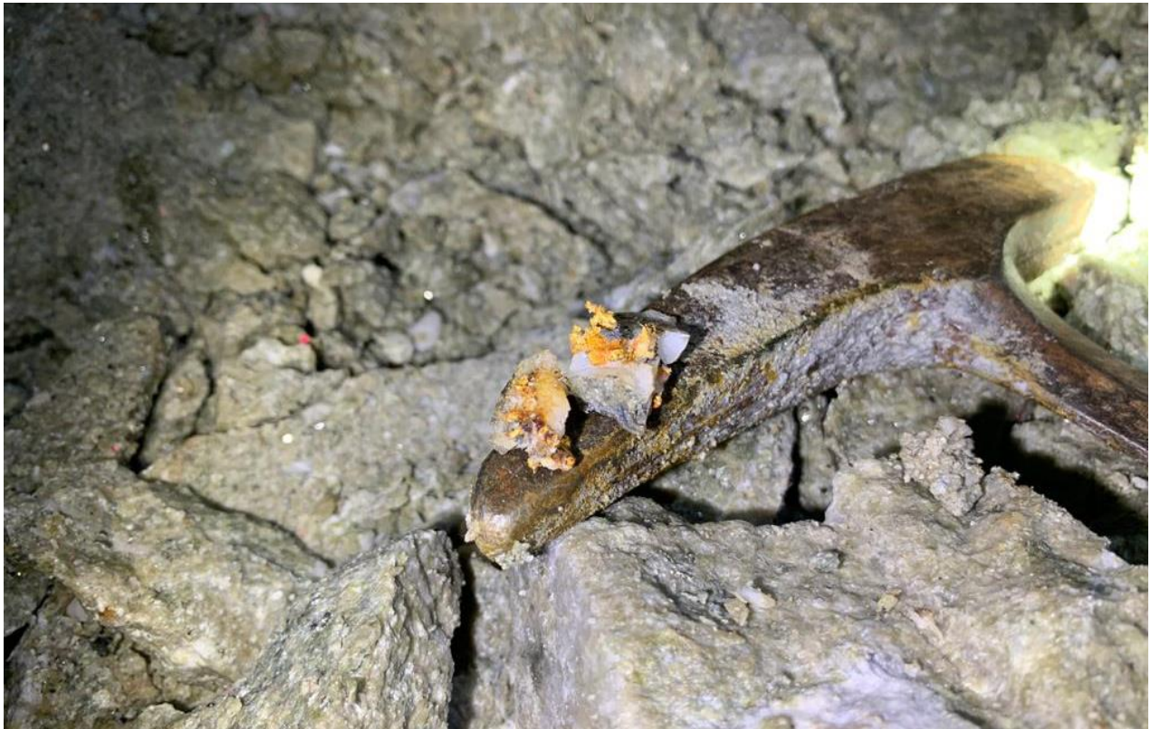
Figure 2: Face sample from the mining areas on 1320mRL showing unusually coarse gold.