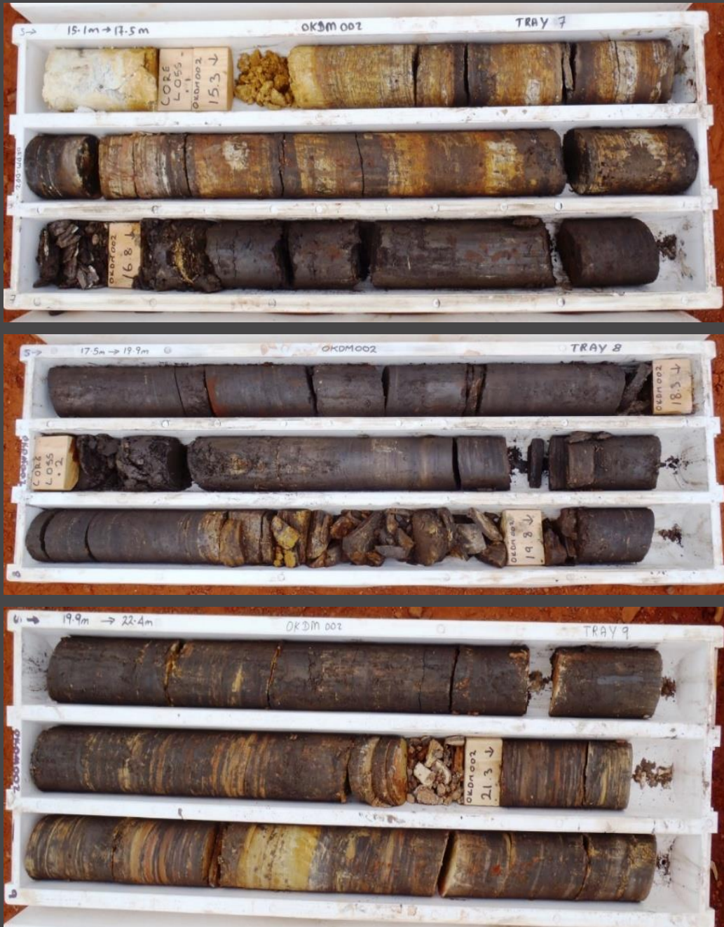
Diamond core hole OKDM002 17.5m to 19.9m. Massive manganese with minor manganiferous shale logged from 16.7m to 20.8mm