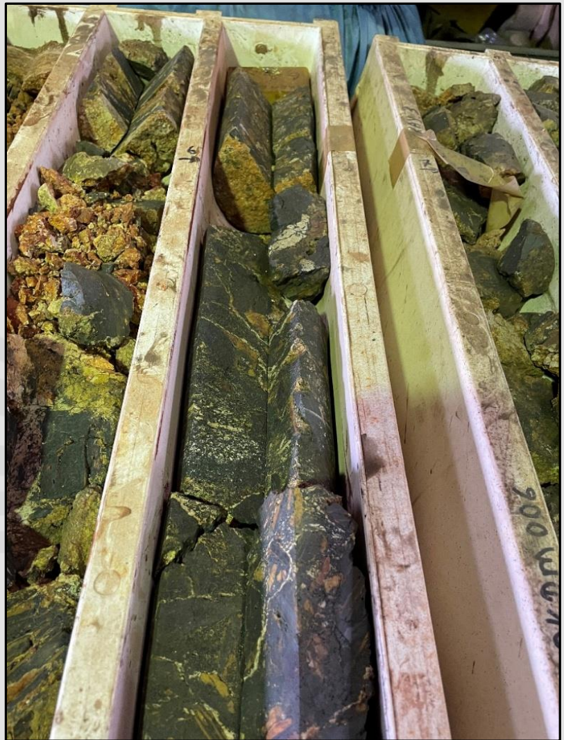
Diamond core hole OKDM006 cut and quartered Massive Manganese