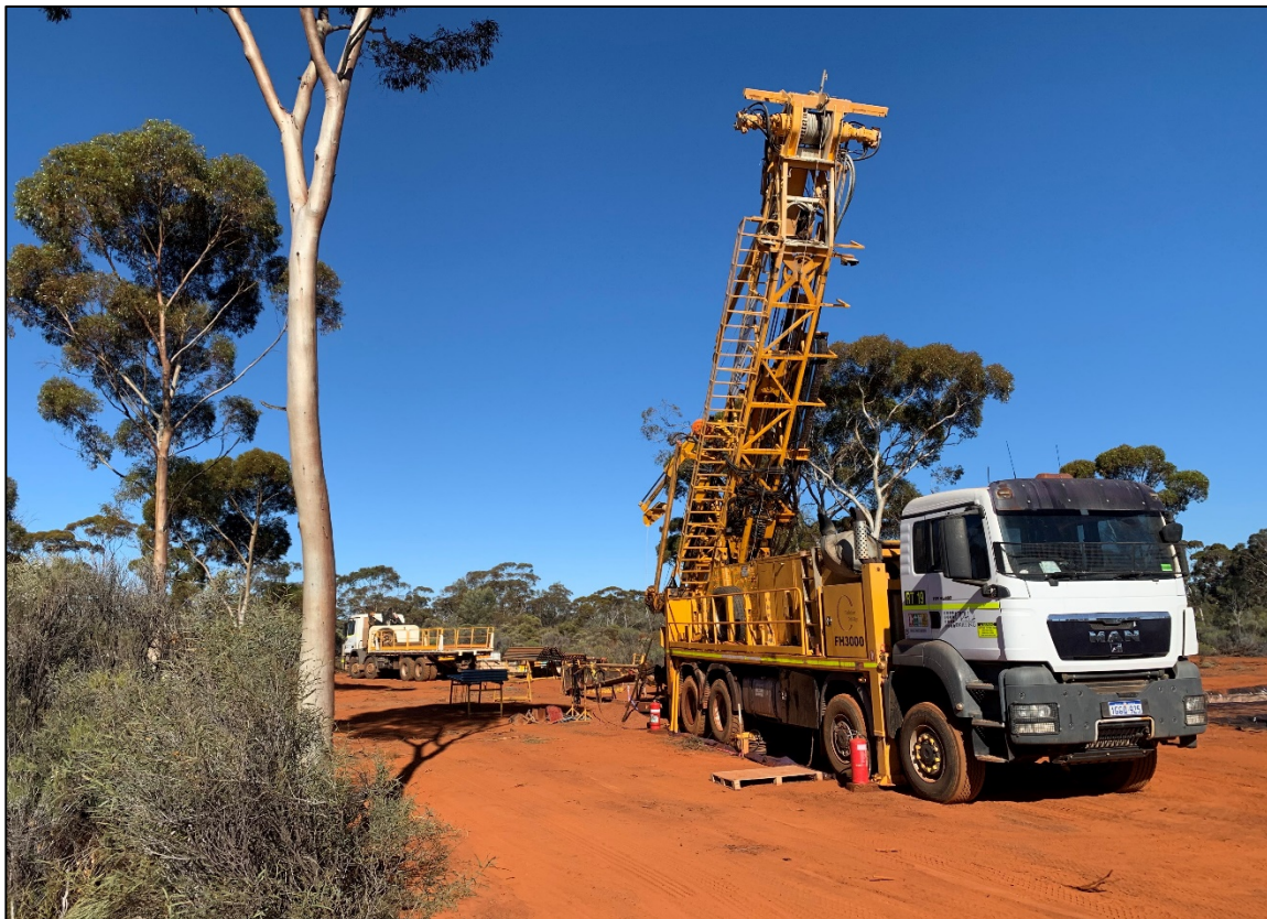
Figure 1. DDH1 drill rig at Commodore

Reverse Circulation (RC) drilling is also scheduled to recommence this week.