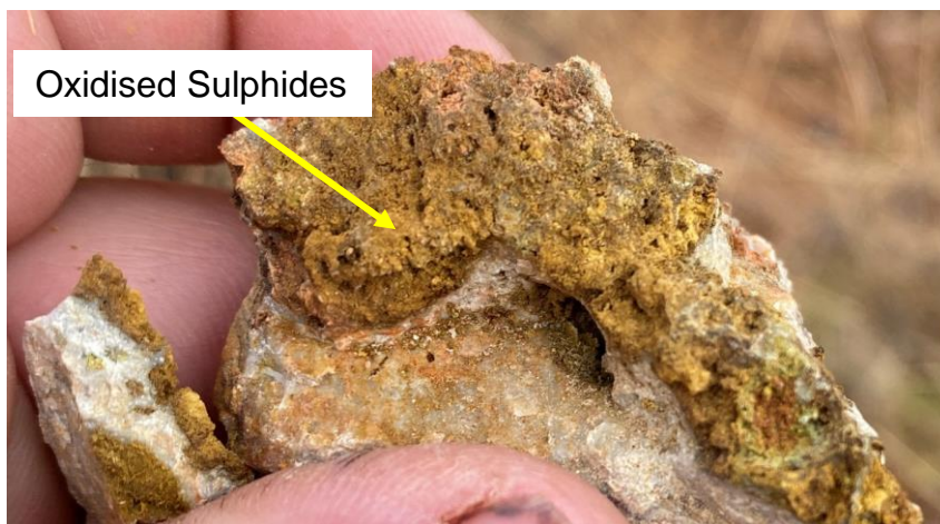
Figure 3 Quartz breccia and veining with oxidised sulphides from Middle Branch (Sample R3000477: 7.01g/t Au).