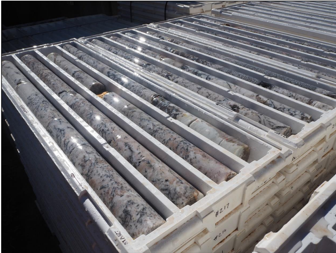
Photograph 1 – NPDD008: part of the thick pegmatite intrusion below the historic Nepean nickel mine from 641.5-993m. Interval shown starts at 663m down-hole

This announcement has been authorised by the Board of Directors of the Company.