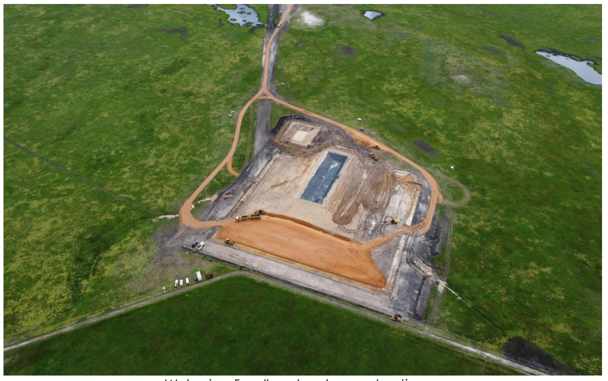
Walyering-5 well pad under construction

Talon Energy Ltd (Talon or the Company ) is pleased to announce that all site works were completed at EP447 by the Joint Venture Operator, Strike Energy (STX) as anticipated, in preparation for the arrival of Ensign Rig 970, and the drilling of the Walyering-5 appraisal well. The Joint Venture is currently awaiting the release of Ensign Rig 970 from the Lockyer Deep well to the north. Upon release it is anticipated that it will take approximately 2 weeks to mobilise to site and set up ahead of drilling commencing.