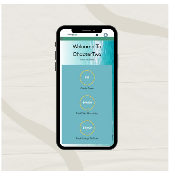
Home screen showing clients credit score, debt amounts and savings to date and debt balances.