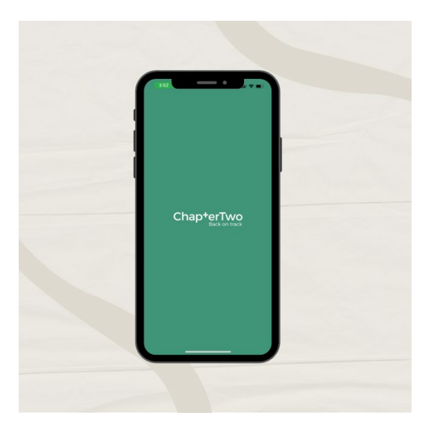
ChapterTwo loading screen