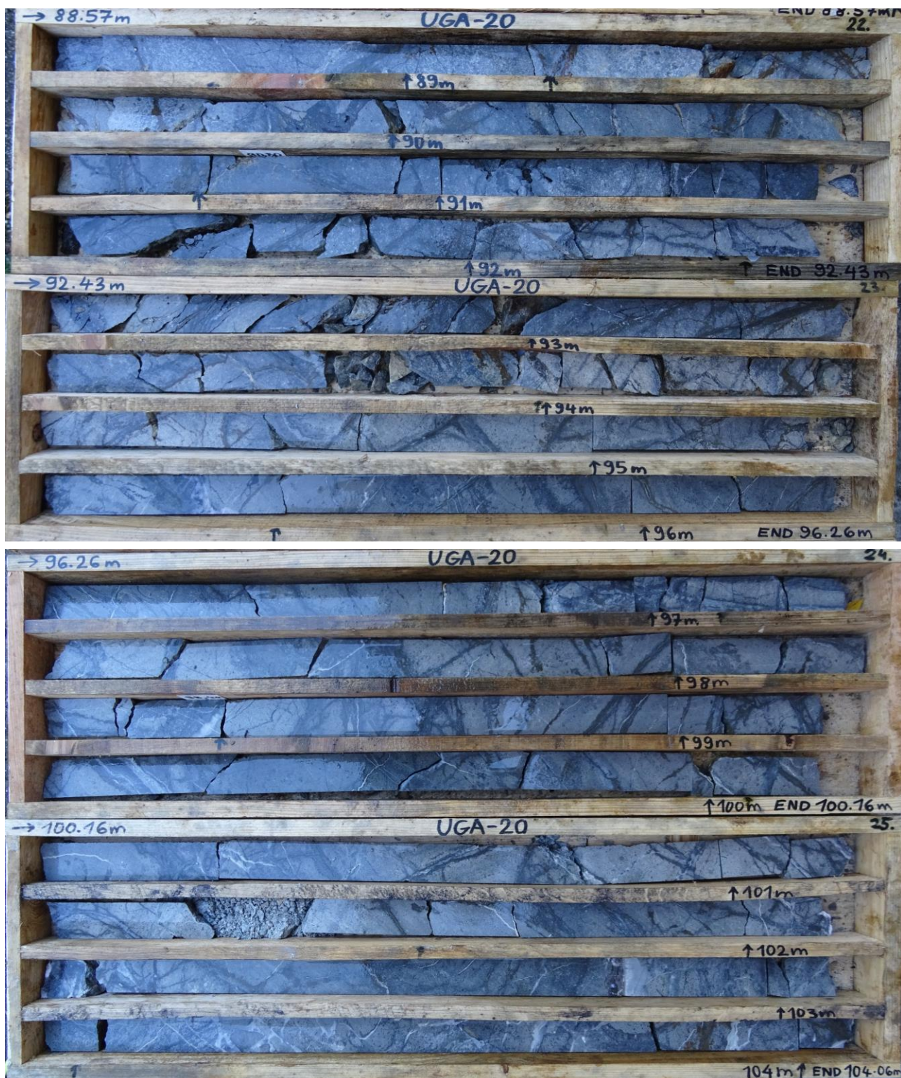
Figure 2: UGA-20 drill core; part of the interval from 75m to 120m (down-hole) showing quartz filled vein/stockwork/breccia structures, variably rich in fine to very fine grained sulphides (mainly pyrite/marcasite) and hosted within strongly argillic altered andesite host rock. Traces of visible gold identified at 97.6m

** This announcement is authorised by the executive board on behalf of the Company **