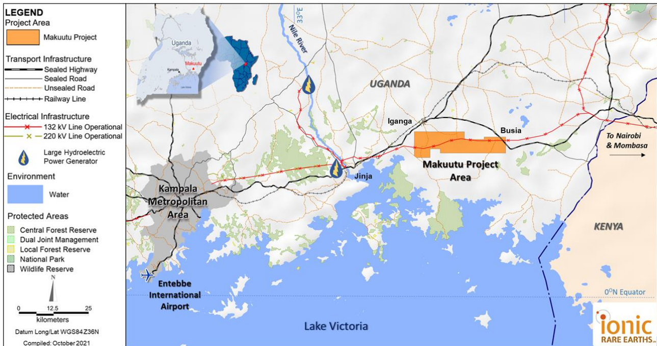
Figure 2: Makuutu Rare Earths Project Location with major existing infrastructure.