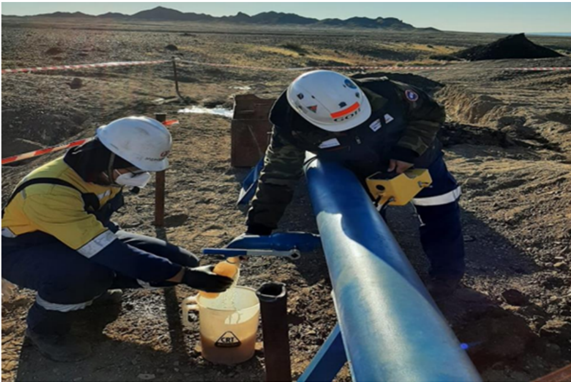
Gas testing and water sample gathering at Nomgon 6

The extensive information gathered from this well will now feed directly into the planning for a long term pilot production testing program planned for 2022, which is currently underway. The Nomgon 6 well has been suspended and will be used as a monitoring well in that program.