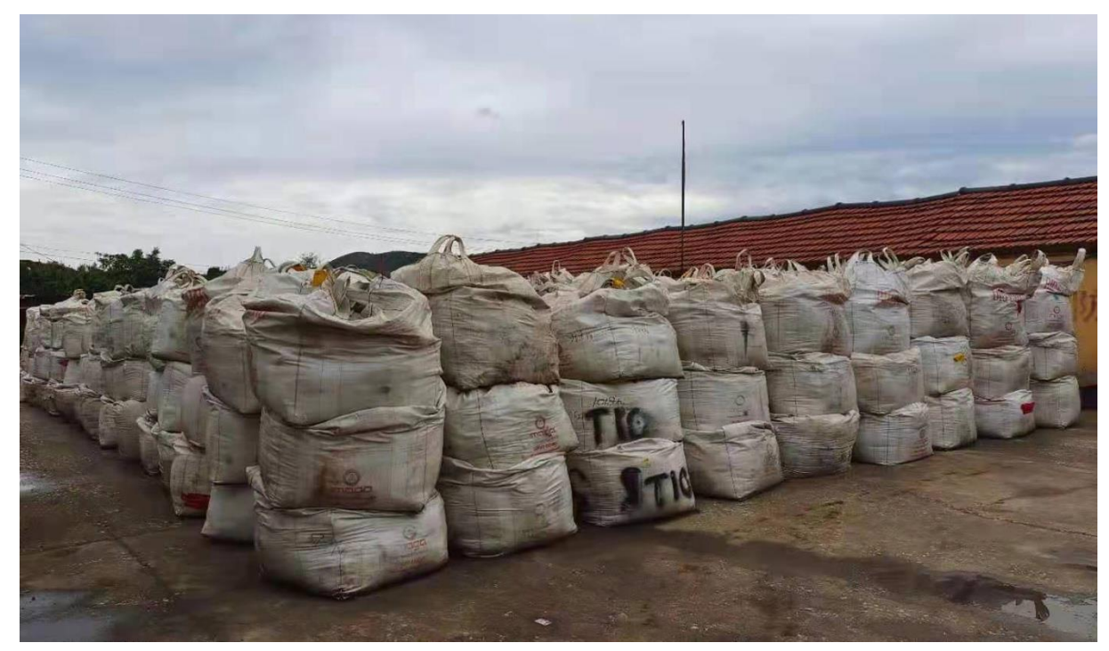
Figure 1 - 500 tonne Mahenge bulk samples arrive for POSCO supply chain qualification test works