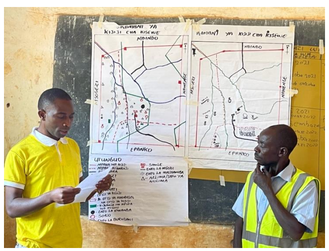
Figure 5 - Field officers support community to map land use as part compensation determination (RAP)