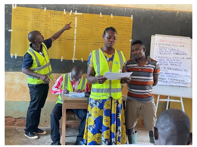
Figure 4 - Public process encourages community participation in developing how resettlement will occur (RAP)