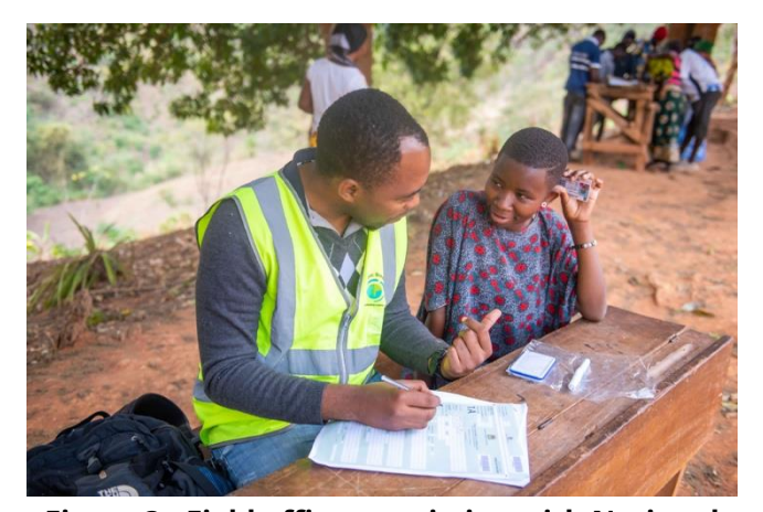
Figure 3 - Field officers assisting with National ID registration (RAP)