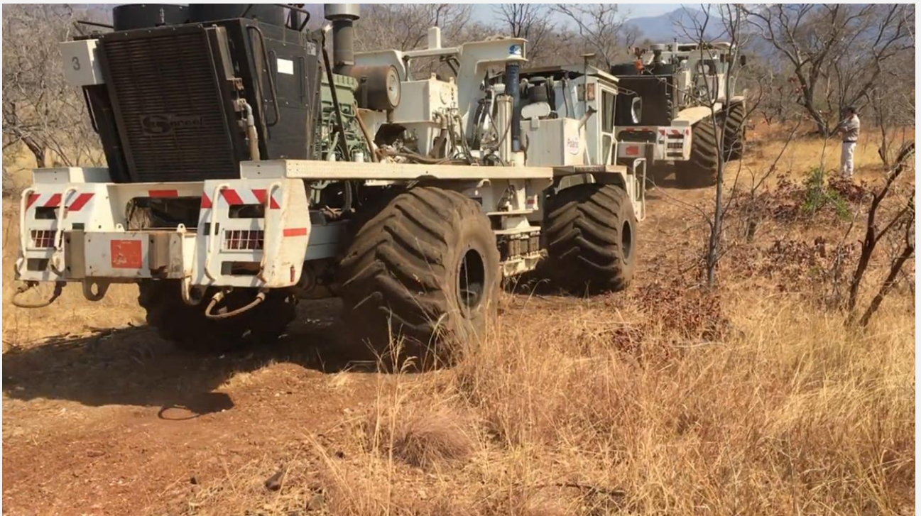
Figure 1- Vibroseis units in the field acquiring data during the CB21 Seismic Survey

The Company will process and interpret the new 2D seismic data in order to refine the Muzarabani-1 drilling location and well path and identify any additional prospectivity for the upcoming drilling campaign.