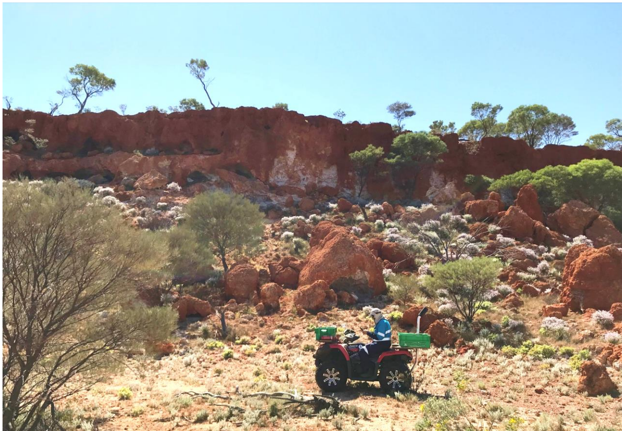
Figure 1 Photograph of the Tower AOI showing well developed lateritic cap and extent of regolith, which extends for kilometres