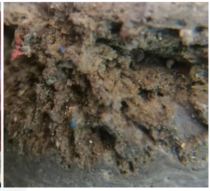
Figure 1- Disseminated nodular analcime (left) and oxidized sulphide lenses (middle), and fine, disseminated sulphides replacing most likely soluble borate minerals - pseudomorphs

The Mapping program also identified prospective, intercalated, lacustrine sediments comprised chiefly of marlstone, claystone, and siltstone. The Company appointed a drilling contractor in August in preparation for drilling which is now set to commence. 10