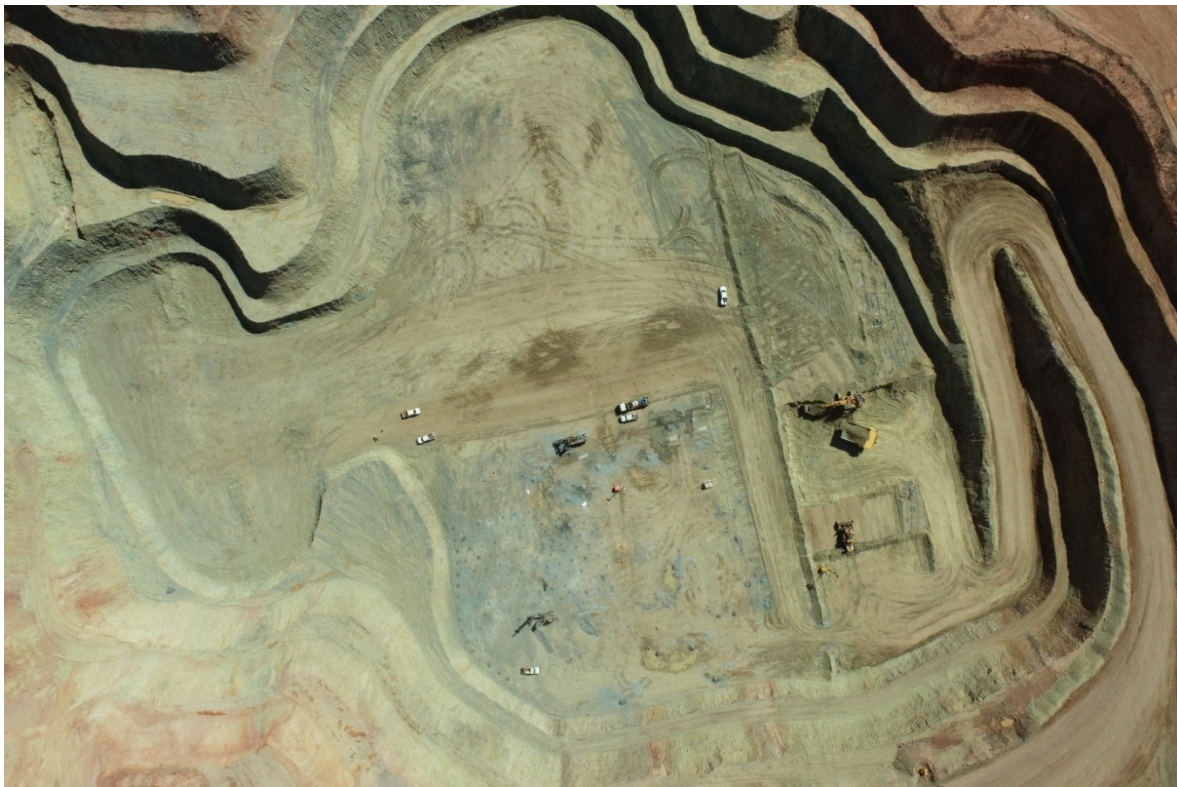
Riverina open pit (northern end).