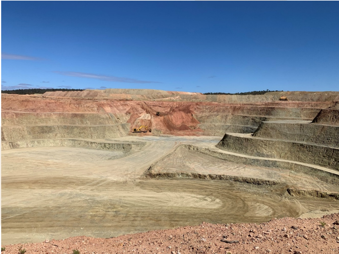
Riverina open pit (looking west) showing rehabilitation work of slip underway.