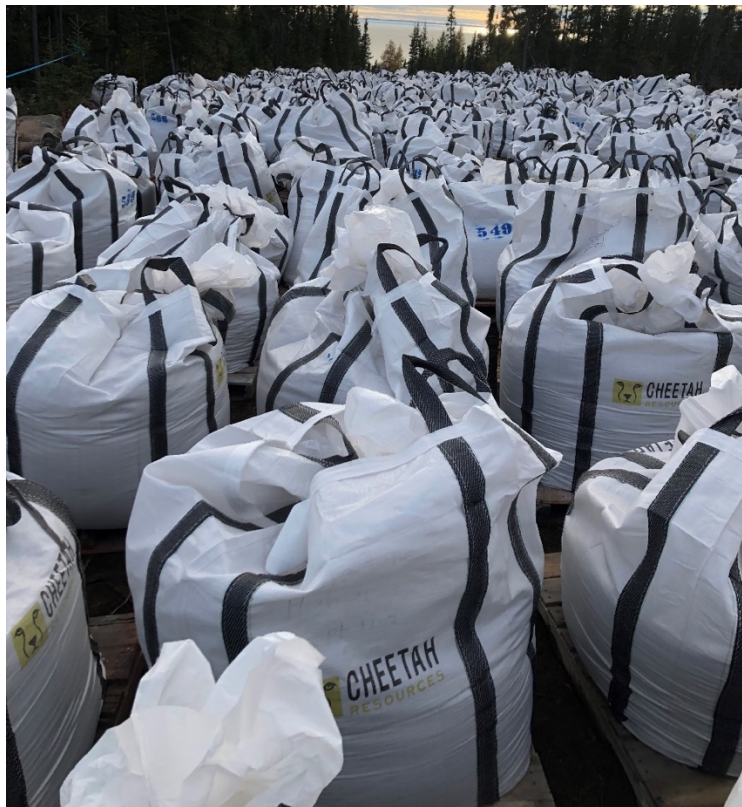
Figure 1 - Bags of rare earth concentrate produced at Nechalacho awaiting shipment