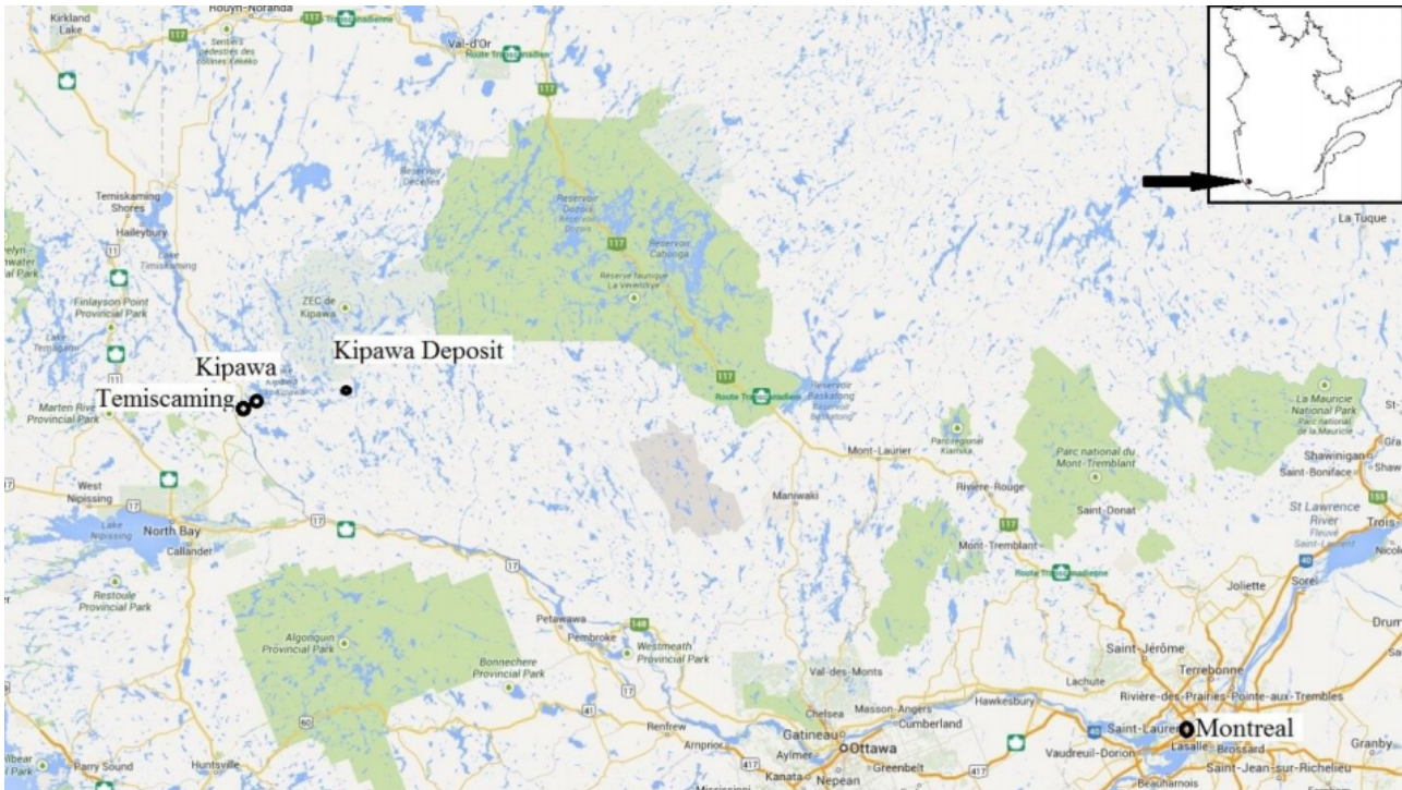
Figure 4 - Location of Kipawa rare earth project, Quebec, Canada

During the quarter, Vital announced it had signed a binding term sheet with Quebec Precious Metals Corporation (TSX.V: QPM, OTCQB: CJCF, FSE: YXEP) (“QPM”) for VML’s acquisition of QPM’s 68% interest in the Kipawa exploration project and 100% interest in the Zeus exploration project (the “Projects”) for C$8m, payable over 4 years. Joint Venture partner Investissement Québec (“IQ”) holds the remaining 32% of the Kipawa project on a contributing basis.