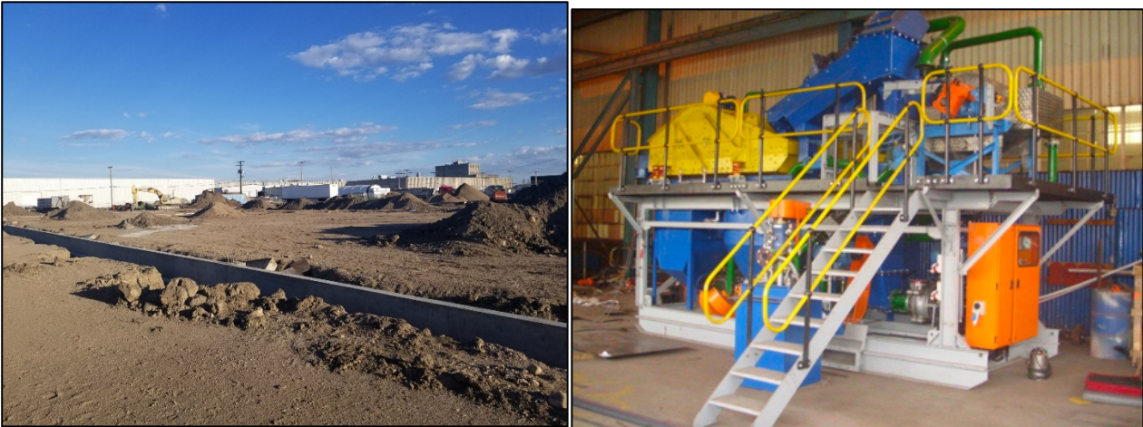
Figures 2 & 3 - Construction is underway on Vital's rare earth extraction facility in Saskatoon, which will incorporate a Dense Media Separator (right) in the extraction process

Commissioning of the plant is expected to occur incrementally over the first half of CY2022 and first product out is scheduled to occur end of H1 CY22.