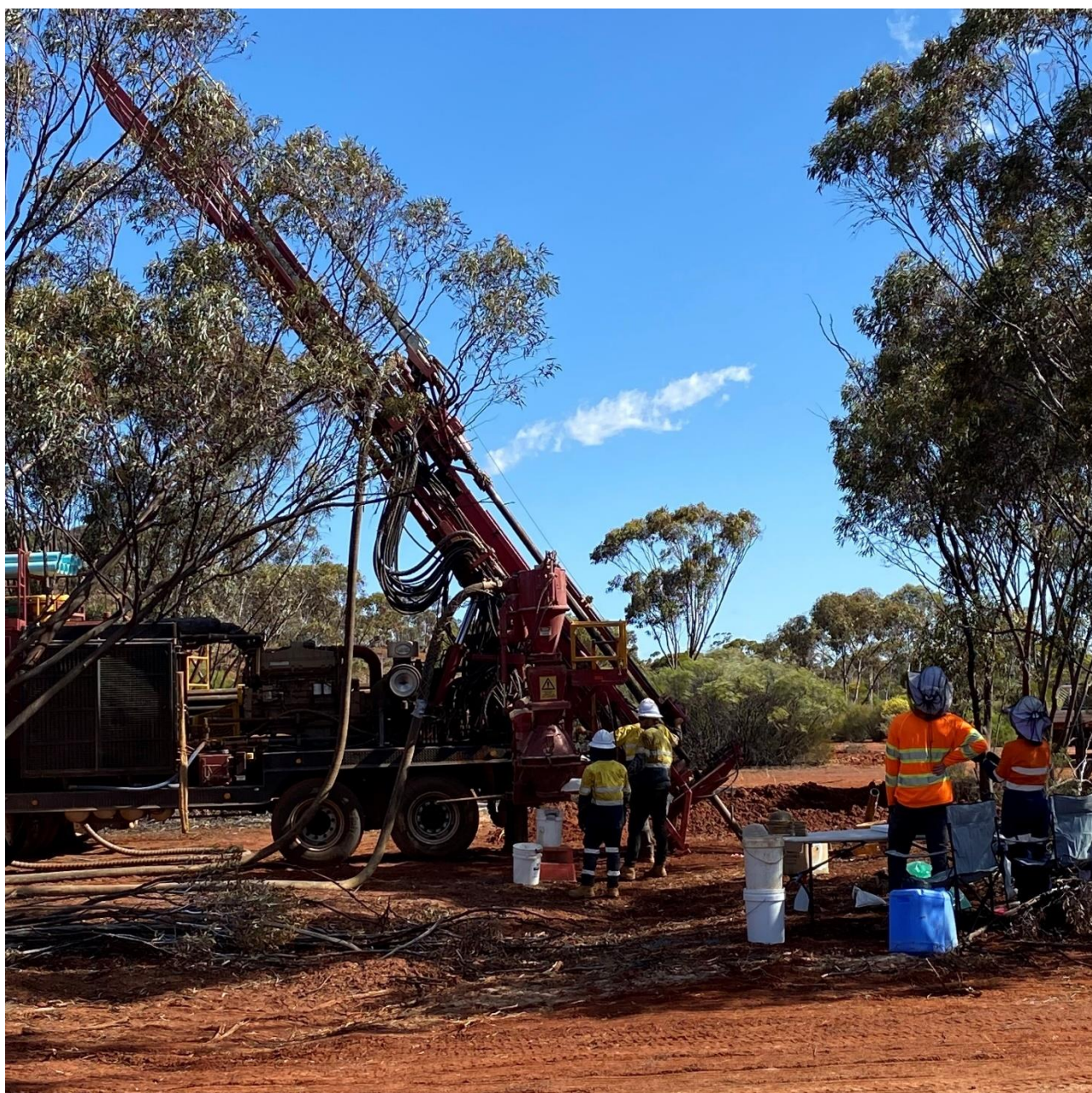
Figure 1 – RC drill rig at Mt Dimer, Lightning Deposit, on 01/11/2021.