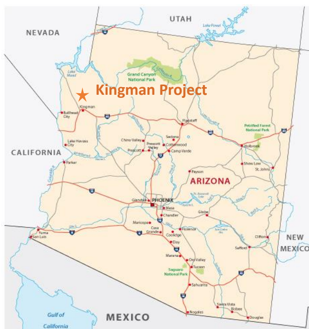
Map 1 – Location of Riedel's Kingman project in Arizona, USA

The Kingman Project is located in north-west Arizona, USA, approximately 90 minutes' drive from downtown Las Vegas and within 5km of a major highway (refer Map 1).