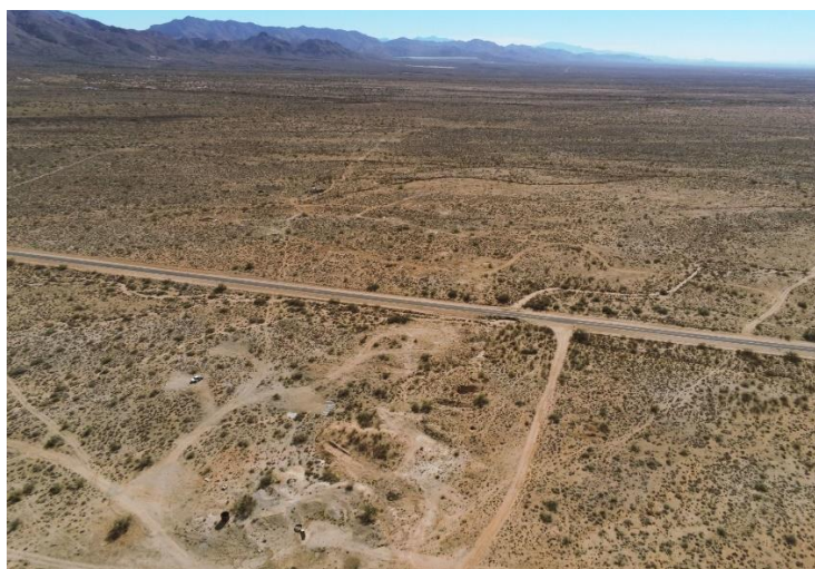
Figure 1 - Tintic mine area in foreground with most recent drilling in area south of the road

“We will announce the drill assay results as they come to hand, and we continue to target later this month for receipt of first assays, subject of course to laboratory turnaround times.”