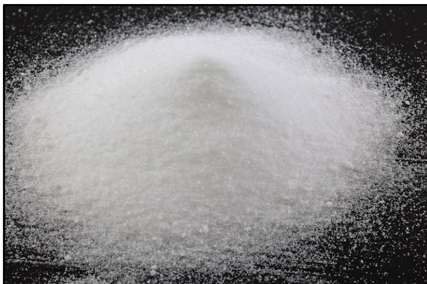
Type 1 Precursor - Aluminium Salt - 5N Purity

King River Resources Limited (ASX:KRR) is pleased to provide this update on the ongoing laboratory work which supports the Definitive Feasibility Study for the Type 1 Precursor Processing Plant. As previously reported (KRR ASX release 8 September 2021) KRR chose to pursue the opportunities associated with the processing of our 5N (99.999%) purity Type 1 Precursor (an Aluminium Salt) required in the battery manufacturing industry.