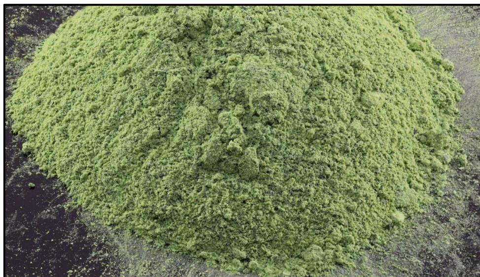
Nickel-Cobalt-Aluminium (NCA) based P-CAM

Receipt and assembly of the laboratory scale Pilot Plant at Source Certain International is complete and commissioning is underway to refine the process and produce Type 1 Precursor product market samples for distribution.