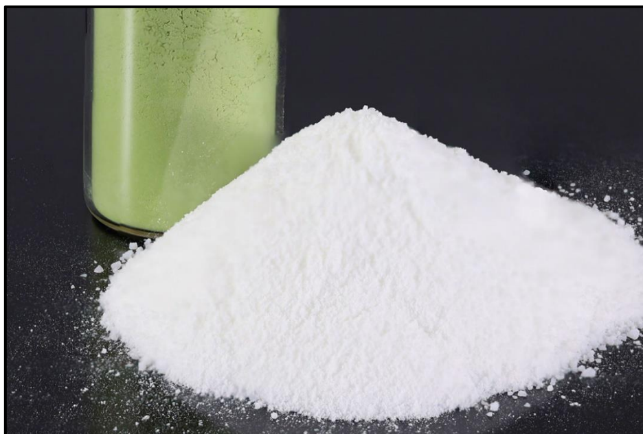
Type 2 Precursor - Aluminium Compound (P-CAM in background)

At this stage, it is not KRR's intention to become a P-CAM manufacturer but to rather supply its Precursor products as the high purity aluminium source to this expanding market.