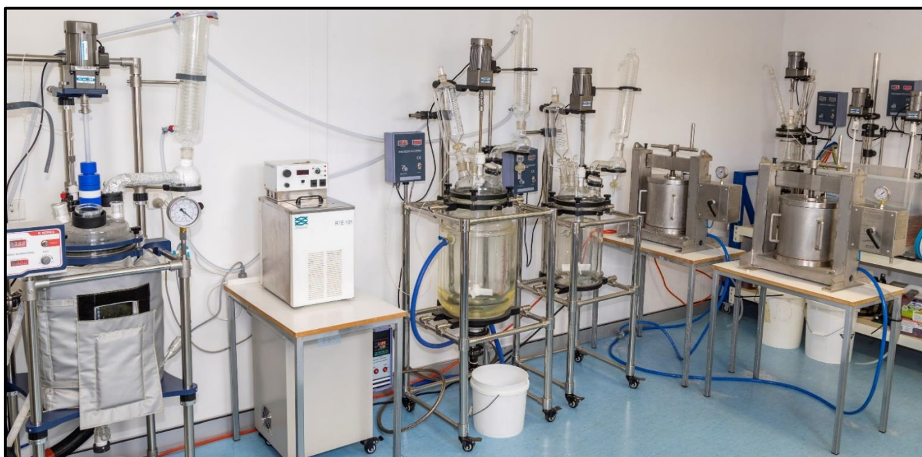
Laboratory Scale Pilot Plant - Precursor production of market samples

Receipt and assembly of the laboratory scale Pilot Plant at Source Certain International is complete and commissioning is underway to refine the process and produce Type 1 Precursor product market samples for distribution.